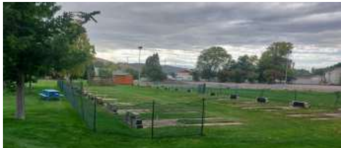
Ross Park →