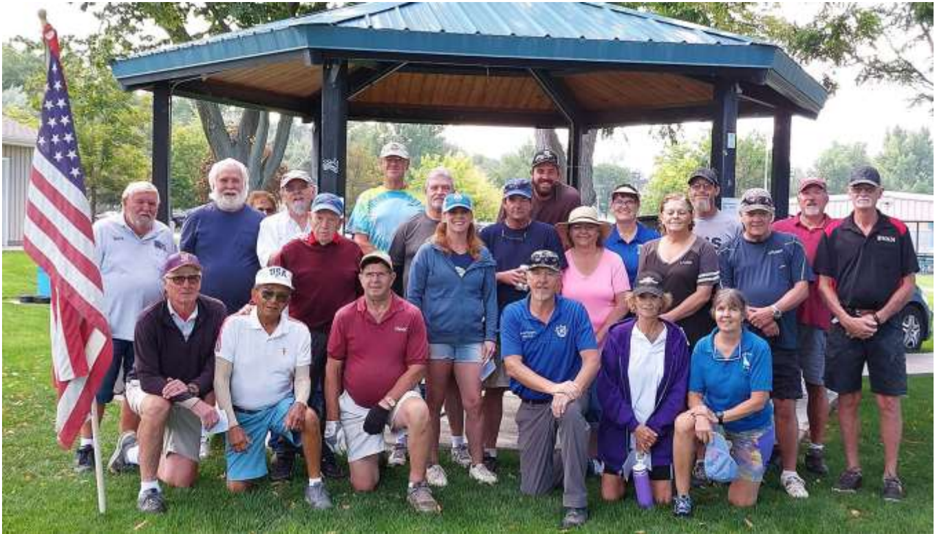
State Singles Participants